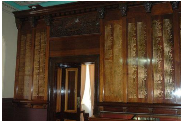
Honour Board in foyer of Hobart Town Hall