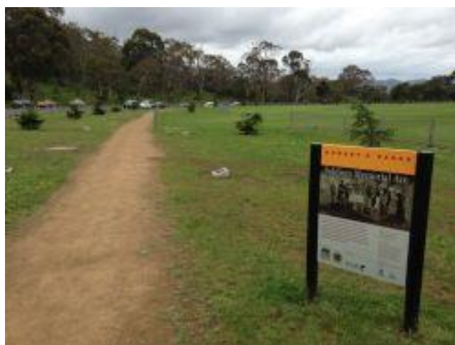
Soldiers Memorial Avenue, Hobart